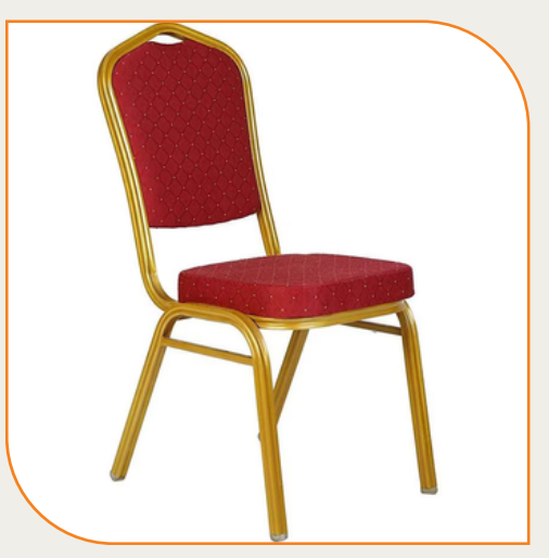
Plain Chair - AED 5