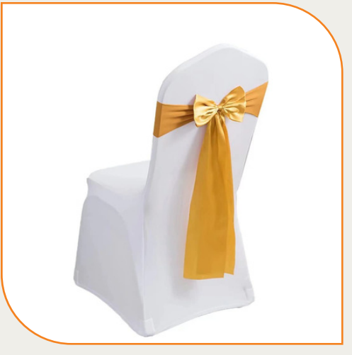
Stretch Fabric & Bow - AED 7 Bow Colours : Black, Gold, White, Blue