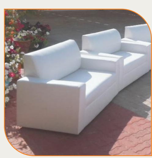
Sofa Set - AED 75 / 150 / 250