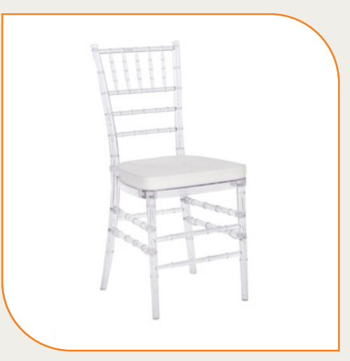
Acrylic Chair - AED 18