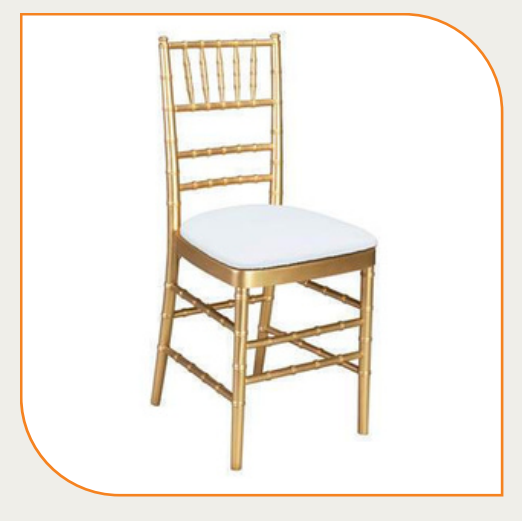
Chiavari Chair - AED 15