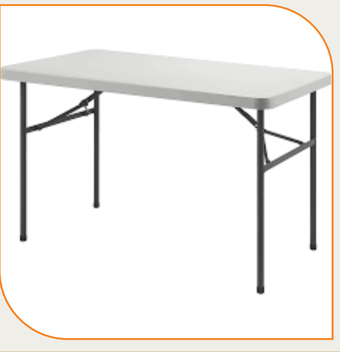
Rectangular Table - AED 35